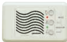
PAN-Q816S White Room Station