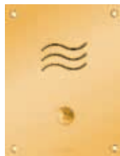
PAN-BPlate Brass Door Plate (155H x 120W)

Coloured Door Station Mounting Blocks (not shown) PAN-MB816S (Silver Mounting Block) PAN-MB816G (Gold Mounting Block)