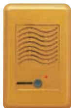
PAN-Q816DG Gold Door Station