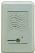
PAN-Q816DS Silver Door Station