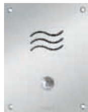
PAN-CPlate Chrome Door Plate (155H x 120W)